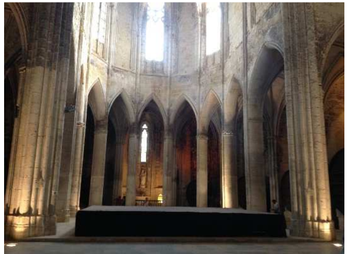
Abbaye de Valmagne