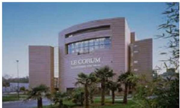
The Corum Congress Center