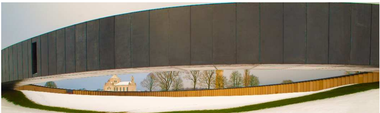
Ring of Memory (Notre-Dame de Lorette Memorial, France)

Founded in 1904, the American Concrete Institute (ACI) is a leading authority and resource worldwide for the development and distribution of consensus-based standards, technical resources, educational programs, and proven expertise for individuals and organizations involved in concrete design, construction, and materials, who share a commitment to pursuing the best use of concrete. ACI has over 101 chapters, among which the ACI Paris chapter for French-speaking European countries, and nearly 20,000 members spanning over 120 countries.