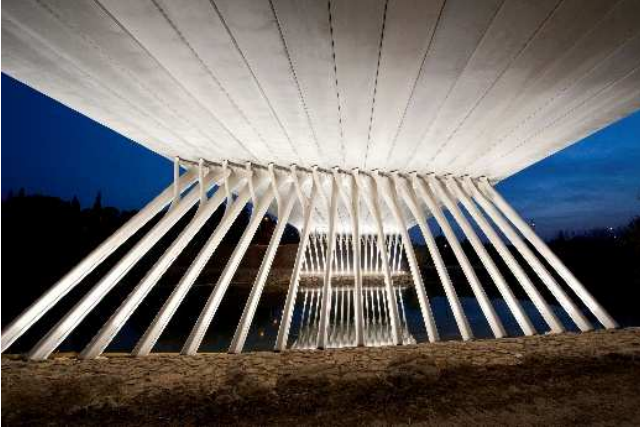
Pont de la République © Lisa Ricciotti