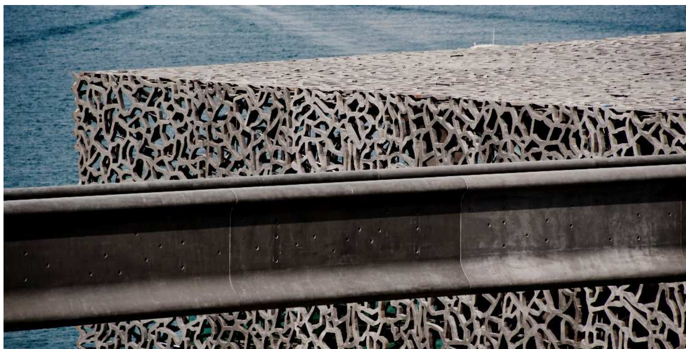
Mucem (Marseille, France)

The on-line registration will be possible on the website www.afgc.asso.fr/UHPFRC2017