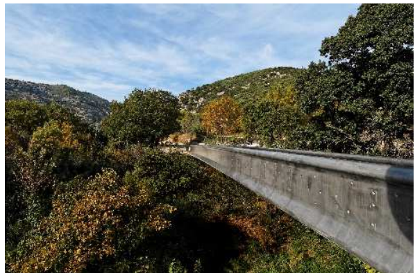
Angels Footbridge

The international conference UHPFRC 2017 will be held at Le Corum Congress Center in Montpellier from October 2 - 4, 2017. Le Corum is characterized by a unique and modern architecture. The building is dedicated to culture, business, science and combines in a single site the most modern techniques of a congress center. It is located just at the edge of the very historic city center at a 10 mn-walking distance from Montpellier-Saint Roch train station.