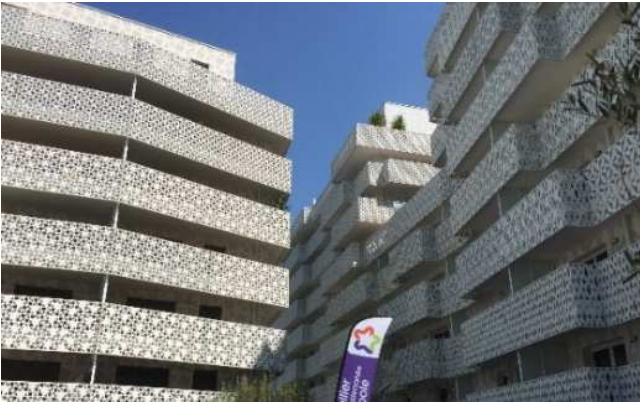
La Mantilla © Eiffage