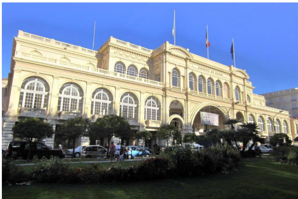
Palais de l'Europe of Menton

A technical visit of UHPFRC applications in Monaco and the French Riviera will be organized during the symposium.