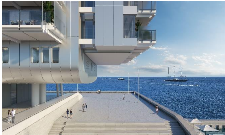
Mareterra- Cantilevered part of the Renzo