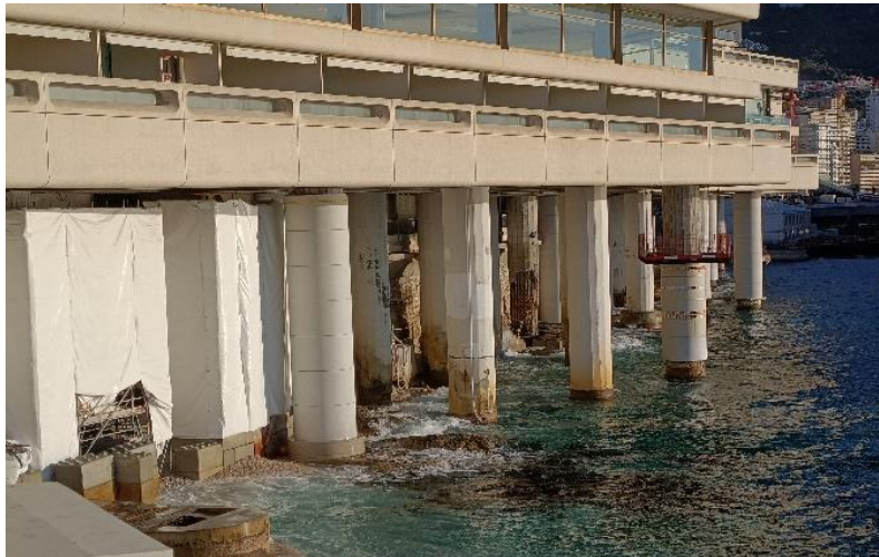
Reinforcement of the Spelugues piers