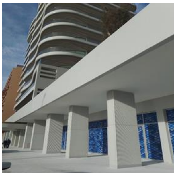
Palais de la Plage

The International Association for Bridge and Structural Engineering (IABSE) is a scientific / technical Association comprising members in 100 countries and counting 58 National Groups worldwide. Founded in 1929 it has its seat in Zurich, Switzerland. The President of IABSE (2022-2025) is Tina Vejrum, Denmark. IABSE deals with all aspects of structural engineering: the science and art of planning, design, construction, operation, monitoring and inspection, maintenance, rehabilitation and preservation, demolition and dismantling of structures, taking into consideration technical, economic, environmental, aesthetic and social aspects. The term 'Structures' includes bridges, buildings and all types of civil engineering structures, composed of any structural material.