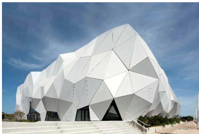
Cannes Multiplex Cinéma